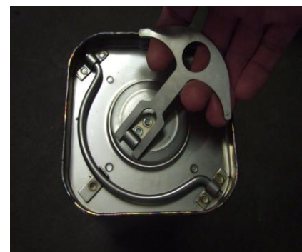
Figure 3 – toggle bar