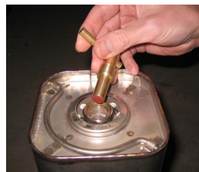
Figure 4 – Positioning the igniter Match