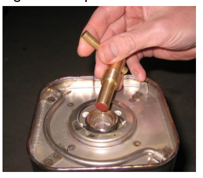
Figure 5 – toggle bar