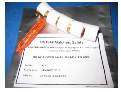
Figure 2 – key and tear strip