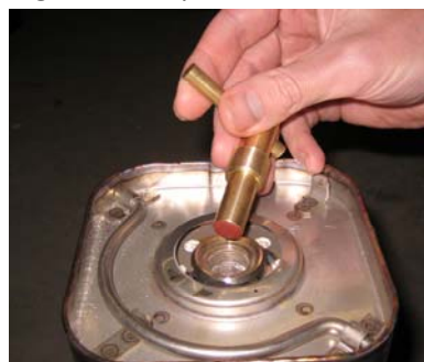
Figure 4 – Top of inner canister

WARNING – exposed sharp edges to tear off seal.