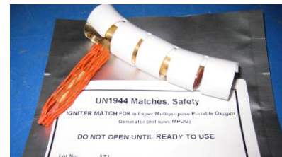
Figure 2 – exposing the ignition port