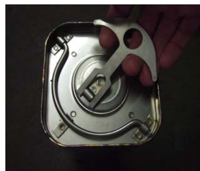
Figure 3 – toggle bar